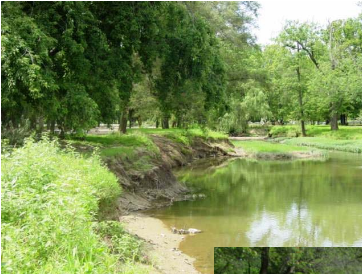
Left: Before construction. Highly eroded and unstable banks

The Youngs Creek Watershed Cost-share program continues to wrap up projects. The Johnson County SWCD, Youngs Creek Watershed, and Franklin Parks were able to partner on an educational demonstration site project in Province Park. As many people remember the flood of 2008, Province Park was hit especially hard as Youngs Creek and Hurricane Creek come together in this area. One of the main access roads was in danger of being washed out and the banks were unstable. Because this was a park, visual impact had to be taken into account when designing a streambank stabilization project. We tried to minimize the amount of hard armoring of the bank, while using other products such as turf reinforcing mat. This bank stabilization design allows for the largest amount of plant materials to be used. This project was made possible through a $10,000 grant from the Youngs Creek Watershed Cost-share program.