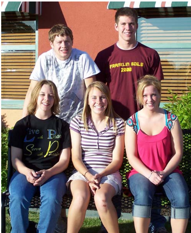
Youth Board Seniors:

Congratulations go out to all the seniors and a thank you for their dedication and efforts to the Youth Board.